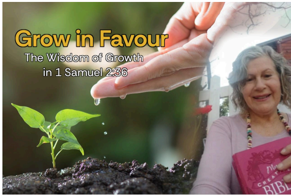
Grow in Favour with God's Grace

Click to read and watch our previous posts.